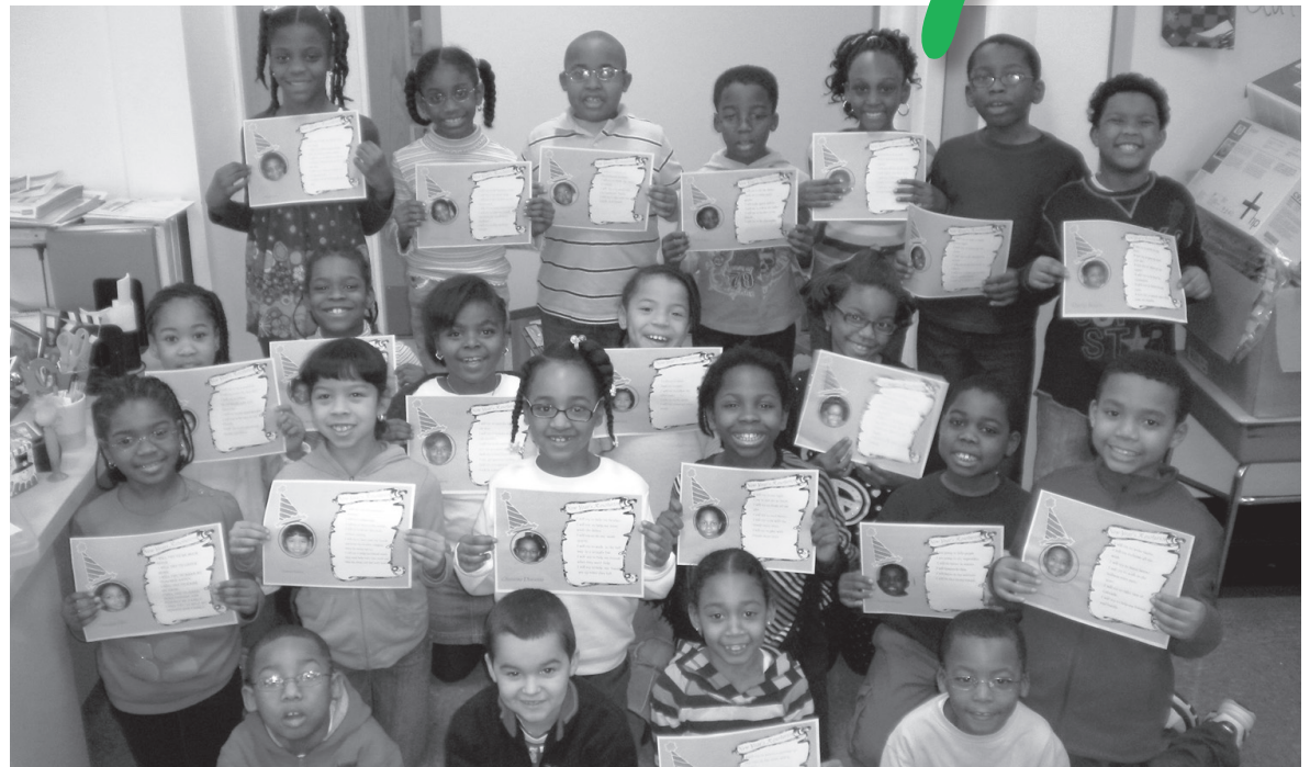
The budget maintains programs that allow students to get creative using technology. Dutch Broadway's second graders followed step-by-step instructions to design their New Year's Resolutions project using the Print Shop computer program.